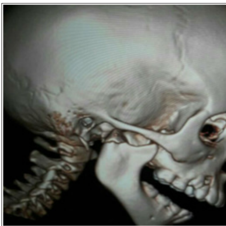
Figure 3: Preoperative 3D showing fractured right condylar neck.