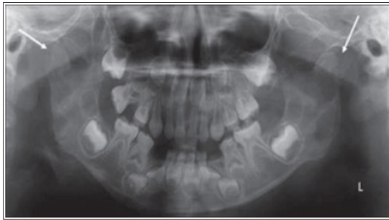
Figure 1: Preoperative OPG showing bilateral condylar head fracture