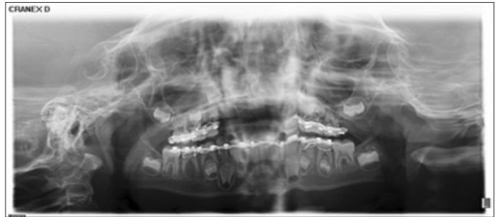
Figure 4: Postoperative OPG showing upper and lower arch bar