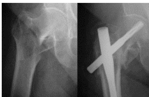
Figure 3: Pain due to blade back-out 6 months after PFN-A™ for an A2 pertrochanteric fracture.

unstable fractures (A2 or A3) requiring operating times longer than 75min. One was an 84-year-old ASA-2 woman with a BMI of 32 kg/m 2 and chronic anticoagulant therapy; her operating time was 92min. The other was a 99-year-old ASA-3 woman with a BMI of 22 kg/m 2 and an operating time of 77min. In the 84-year-old patient, no microorganism was recovered despite protracted culturing; after multidisciplinary discussion, no antibiotics were given, and no recurrent infection had occurred at the surgical site at last follow-up. The 99-year-old patient had specimens positive for an oxacillin-resistant Staphylococcus aureus and was treated with rifampin and fusidic acid. This patient died after her transfer to a nursing home, with no specific cause of death being identified;