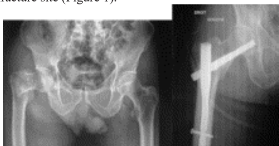
Figure 1: PFN-A™ device with static locking ensuring compression of the A1 fracture via back-out of the helical blade: 3-month follow-up.

The PFN-A™ device is a titanium reconstruction nail. Although this device is available in various lengths, diameters, and blade angles, all the study patients had implantation of the 200-mm nail measuring 10mm in diameter and having a blade-nail angle of 125°. The proximal nail angle in the coronal plane is 6°, to match human anatomy. An aiming device is used to achieve distal locking by inserting a screw through a hole that is either round (static locking) or olive-shaped (dynamic locking). The cephalic end of the device is a helical blade whose shape precludes rotation once locking is achieved but allows back-out to obtain compression of the fracture site (Figure 1).